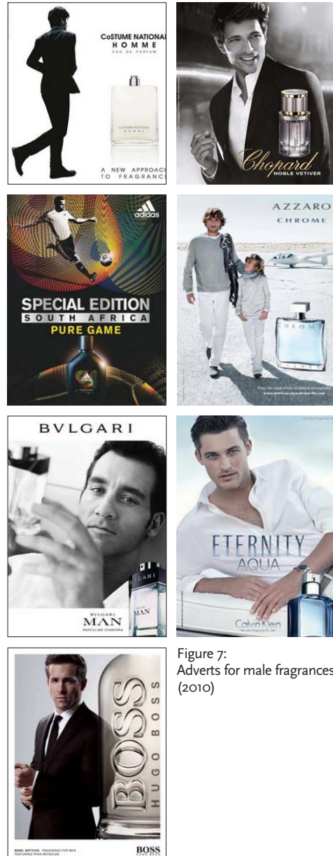
Figure 7: Adverts for male fragrances (2010)

Adverts for men's fragrances also use male models. However, the way they are depicted still differs considerably from the adverts for women's perfumes. Nakedness is less exploited, and models are frequently depicted in more casual positions, emphasizing lifestyle rather than sensuality. Nonetheless, there seems to be an increasing tendency to use the male figure in identical ways to their female counterparts, and the exploitation of men's body in advertising, including nakedness, has become increasingly more common (Cortese, 2004: 30) (Figure 7).