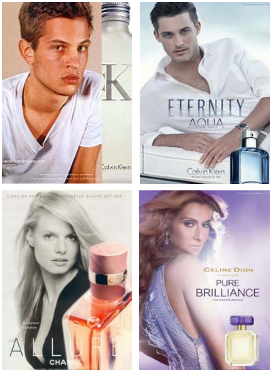
Figure 14: Male and female adverts, from 2010 and 2011

It is also true that advertising has become more audacious, exploiting images of romantic love, but especially eroticism and hedonism, as well as images that clearly challenge and subvert traditional values. This also a characteristic shared by both female and male perfume adverts. Based on our analysis, we may claim that almost all of the adverts collected – for men as well as for women's fragrances – would fit into the themes of love and eroticism, with more or less extreme approaches, lifestyle (professions, fashion, sports, glamour and sophistication), exoticism and 'made in' concepts, as well as religious motifs, however subverted they may appear. However, if we look at the way such themes are distributed according to gender, there seems to be an emphasis on themes such as sports and business/professions in