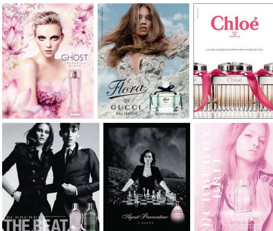
Figure 4: Examples of 2011 ads