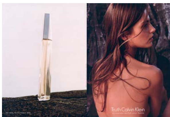
Figure 11: Calvin Klein Truth ('Senses don't lie')

Cook describes perfume adverts as 'ticklers', with very short copy, and normally advertised through sudden burst campaigns, in special seasons, such as Christmas or Valentine's Day (1992: 103). In fact, the difficulty in describing a scent in objec-