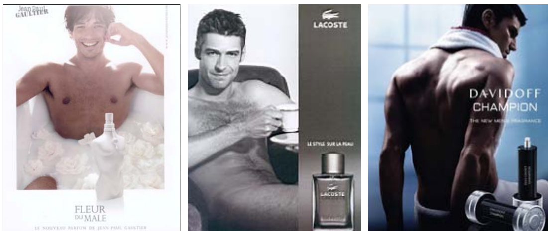
Figure 9 Male adverts (more conventional approaches)

It is possible that this broadening of possibilities in terms of male representation corresponds to a more tolerant view of society as to what the concept of 'masculinity' might encompass. However, we might postulate with Cook that the depiction of tendentially traditional roles still prevails: 'Like other products concerned with sexual relationships, perfume ads wrongly assume an exclusively heterosexual market, although some recent ads may have been deliberately ambivalent about the sexual orientation they portray' (1992: 103).