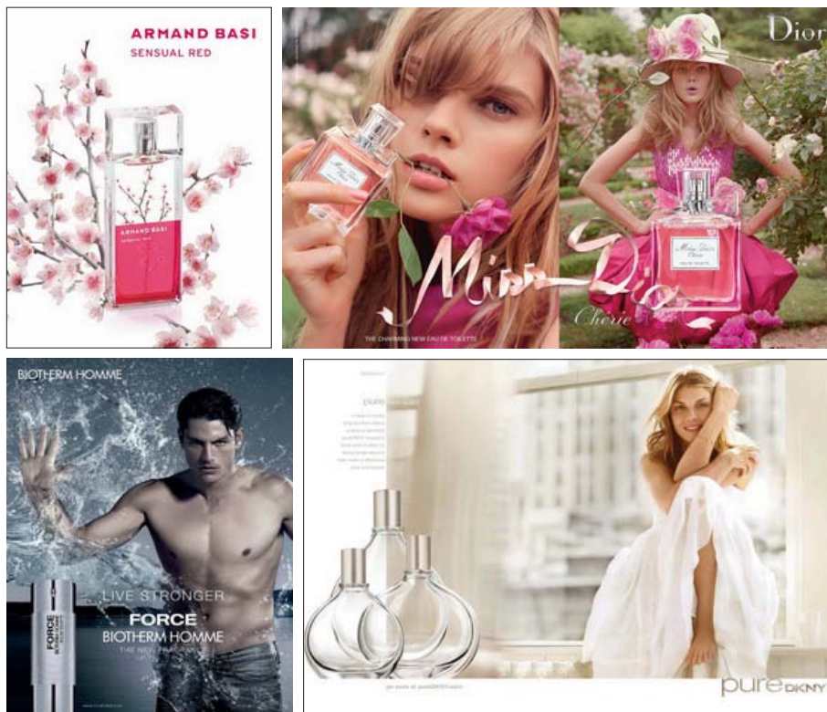
Figure 3: Examples of 2010 ads