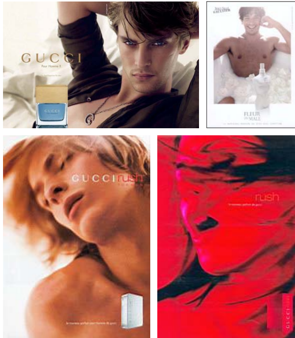
Figure 8: Trends towards convergence in male and female fragrances (Gucci and Gaultier)

image of masculinity. If these two adverts are yet compared to a third one, which illustrates a more traditional approach to advertising's display of male characters, differences become even more evident.