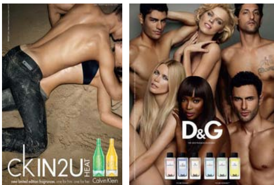
Figure 15: Adverts for male/female fragrances, displaying more audacious approaches