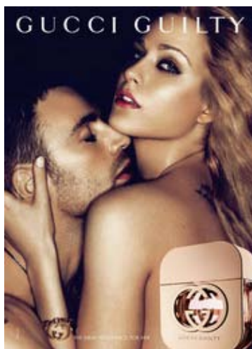
Figure 10: Adverts depicting couples

A motif that is frequently adopted by perfume advertising pictures is the image of a couple, which is recurrent not only in adverts that promote male and female fragrances simultaneously, but also in perfume adverts in general (Figure 10)