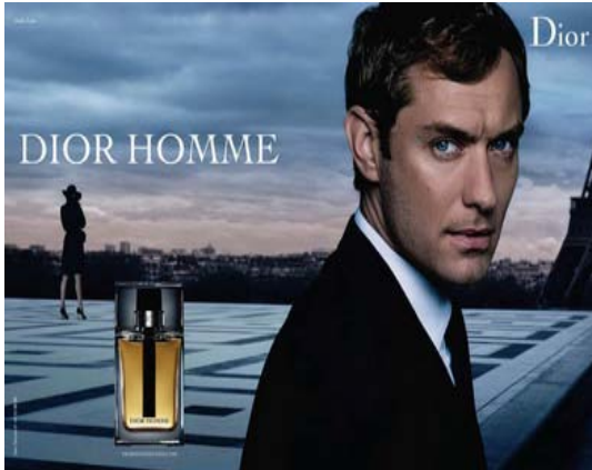
Figure 5: Advert for male fragrance