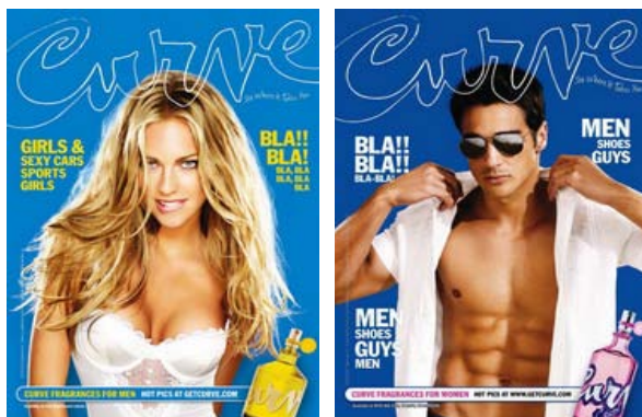
Fig. 13: Male and female adverts foregrounding gendered advertising approaches

As mentioned above, perfume advertising campaigns are often built to be used worldwide in standardized campaigns, and therefore resort to many of the appeals used in such campaigns, as claimed by De Mooij (1994: 244-249), who discusses the themes and concepts that seem more suitable for international campaigns, namely to lifestyle concepts, and to everyday themes, particularly youthfulness and love, as well as to 'made in' concepts, which are exploited in various ways.