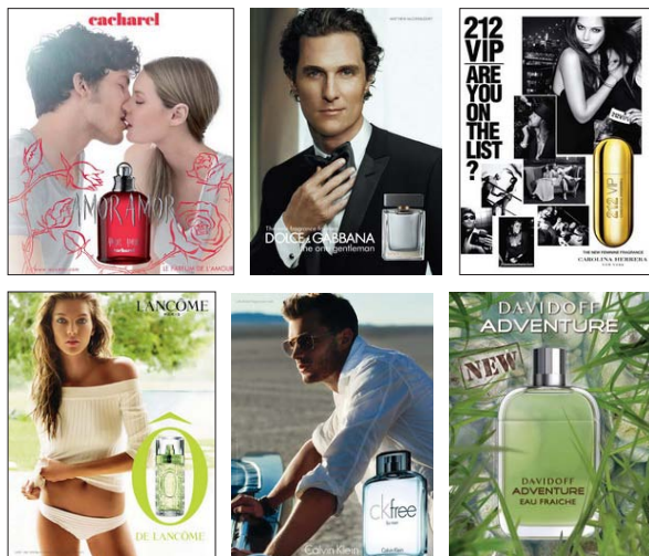
Figure 12: Lifestyle ads