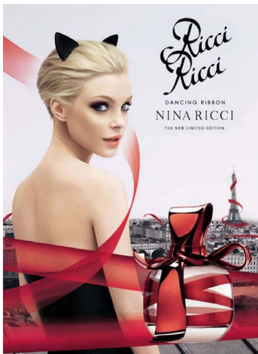
Figure 2: Ricci Ricci, 2011

Perfume ads also seem to confirm precedence of visual elements over verbal ones, not to mention that copy text elements tend to be rather repetitive, unvarying and exiguous. Phrases such as ‘The new fragrance for ... (men/women)’ seem to be rather common, although we intend to look into this aspect more thoroughly below. The names given to perfumes, however, present a richer variety, albeit some lack of diversity as far as motifs or themes are concerned, which justifies a specific analysis of the element ‘name’ in the present study. Even so, the latter are frequently the only or the most prominent verbal element in clearly visual-based advertising, which seems to be consistent with Classen’s view that there has been a rise of visualism in modern Western societies, related to an increased importance of the sense of sight from the Enlightenment on, intensified in contemporary societies: ‘Smell is such a neglected sense in the modern West that we can scarcely conceive of it as being an important subject of cultural elaboration.’ (Classen, 1993:7-8).