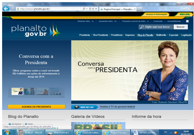
Figure 1- main page of the website of the Presidency of the Republic

On the portal page, as shown in Figure 1, show the President, Vice-President, President, Press, Blog do Planalto, Multimedia, Special Legislation and links, which are objects of the present analysis.