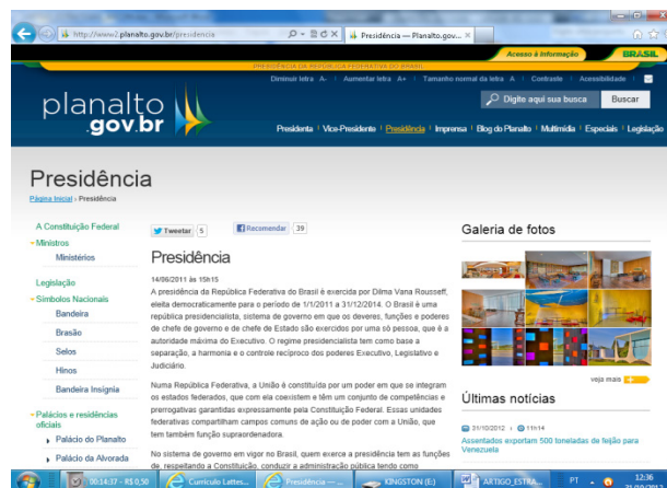
Figure 4 - Link Presidency