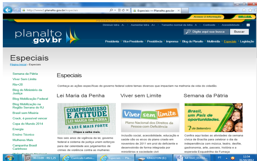
Figure 15 - Special Link

Legislation in (Figure 16) link, the presidency provides: link to the Federal Constitution of 1988, as well as links to access codes, common laws, decrees, Daily Review, Provisional Measures. Still in the Legislation link is information on the ministers of the government of Dilma, National Symbols, palaces and official residences, Structure of the Presidency, the Presidency Library and Gallery of Presidents.