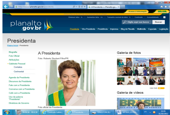
Figure 2 - Link President

palaces and official residences, Palácio do Planalto, the presidential palace, Grange Bent Palace Jaburu, Structure of the Presidency, the Presidency Library, Gallery of Presidents.