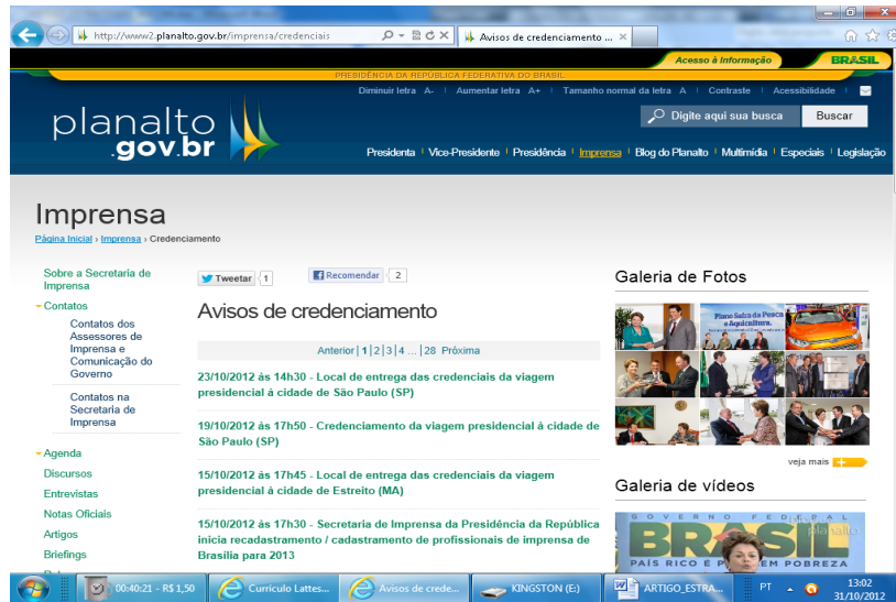
Figure 11 - Link Accreditation

Under any of the links President, Vice-President, President, Press, Blog do Planalto, Multimedia, and Special Legislation is available a summary of key information and services portal.