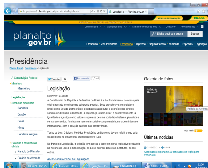
Figure 16 - Link Legislation

Legislation in (Figure 16) link, the presidency provides: link to the Federal Constitution of 1988, as well as links to access codes, common laws, decrees, Daily Review, Provisional Measures. Still in the Legislation link is information on the ministers of the government of Dilma, National Symbols, palaces and official residences, Structure of the Presidency, the Presidency Library and Gallery of Presidents.