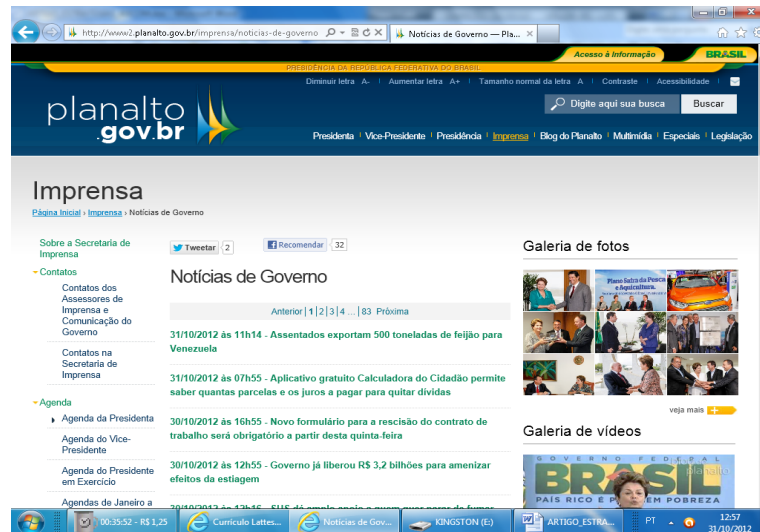
Figure 5- Link Press

In the Press in the News Government (figure 5), there are news link, photos and videos galleries and links: About the Department of Press, Aides Contacts of Press and Communication of the Government, the Secretary of Press Contacts, Agenda President, Vice-President of the agenda, the President in Exercise Diary, Calendar January to July 2011, and Speeches, Interviews, Official Notes, Articles, Briefings, Releases, Government News, Coffee with the President, Conversation with the President, Good Day Minister, Brazil in Tariff, Brazilian, Accreditation and Reports of the Secretary of the Press.