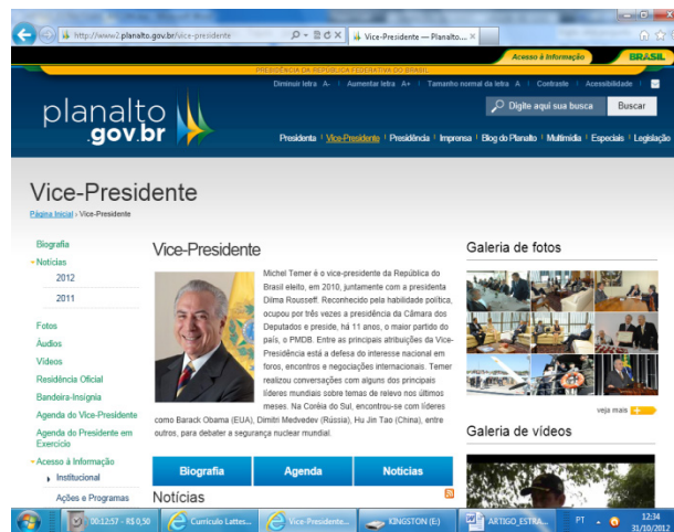
Figure 3 - Link Vice President