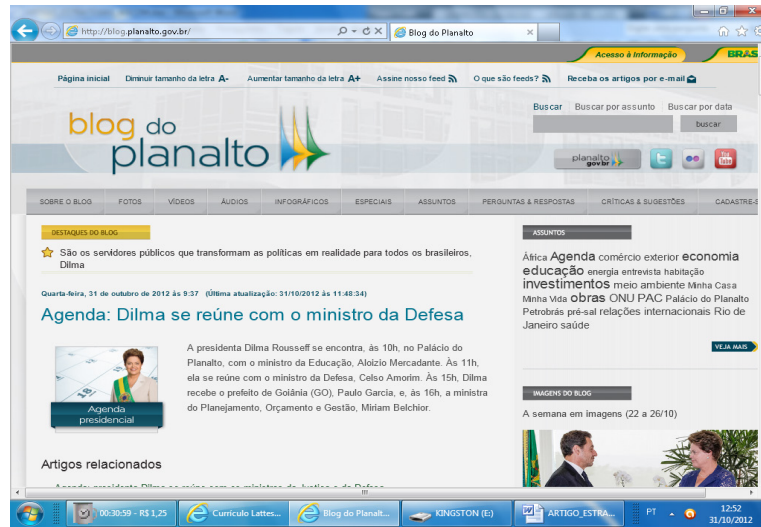
Figure 13 - Link Blog do Planalto

Also included on the Multimedia page (Figure 14), with Photo Gallery, Gallery Audios and Video Gallery link.