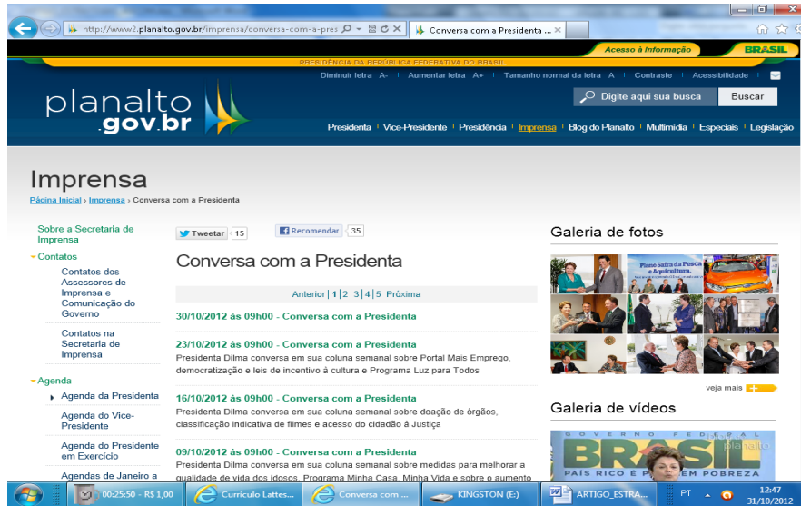
Figure 7 - Link Conversation with the President

In Conversation with the President (figure 7) link, Dilma publishes a weekly column on issues such as: Light for All Program, organ donation, Minha Casa, Minha Vida program on teaching full More Education, answering questions from the population.