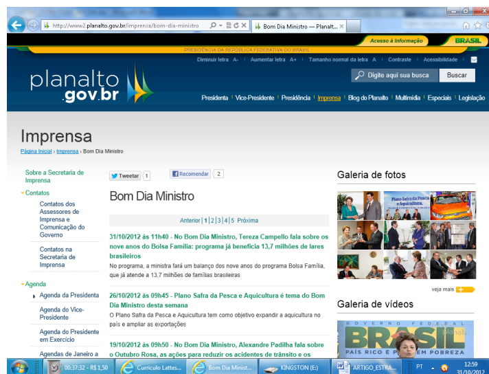
Figure 8 - Link program Good morning Minister

Good morning Minister in the program (Figure 8), the ministers are interviewed on topics such as: Pink October, actions to reduce traffic accidents and joint efforts for health, recovery industry and automotive regime, Plan to Prevent Violence Against the Black Youth, reduced electricity tariff.