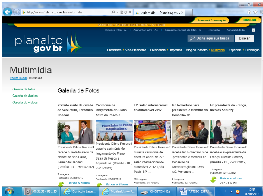
Figure 14 - Link Multimedia

Also included on the Multimedia page (Figure 14), with Photo Gallery, Gallery Audios and Video Gallery link.