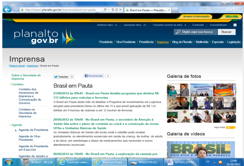
Figure 9 - Link Brazil in Tariff

highways and railroads plan to combat crack, and the construction of new units and PSUs basic health, reducing interest rates and portability of account.