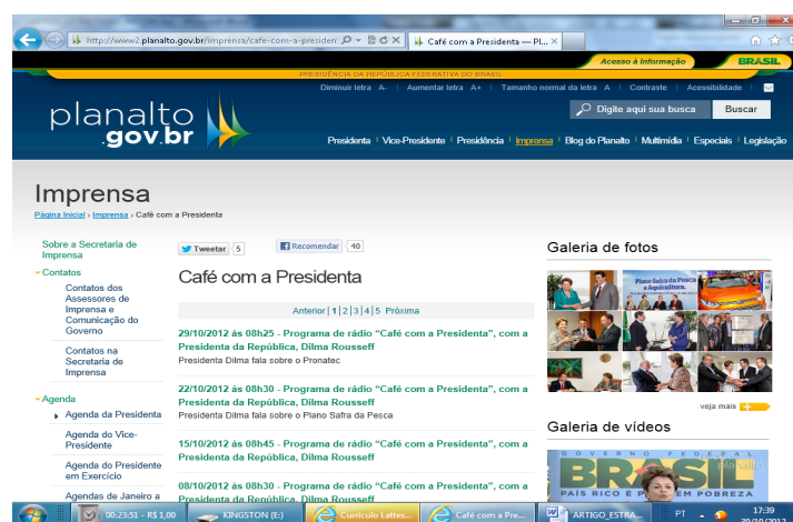
Figure 6 - Link Coffee with the President

Coffee link in with the President (figure 6), included in the press item, the links appear radio programs released every seven days. The interviews are typed and is also provided a link to hear the interview in full.