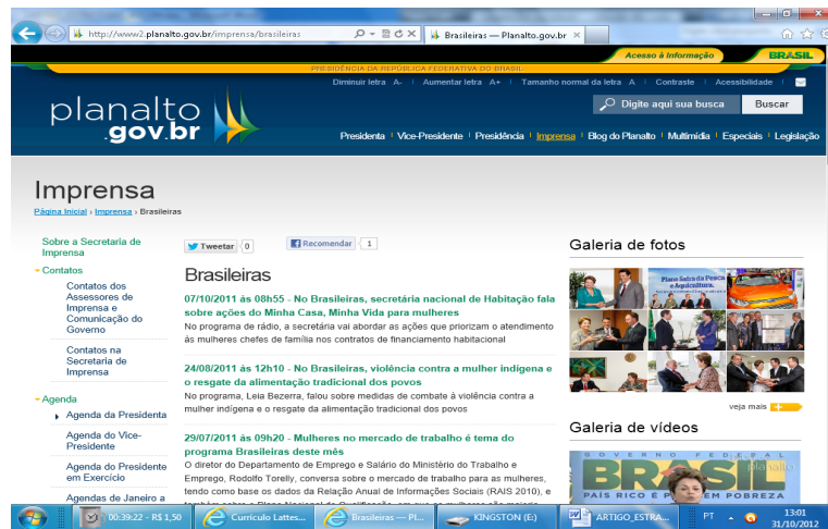
Figure 10 - Link Brazilian

The Brazilian program addresses topics such as housing policies, violence against indigenous Brazilian woman, the labor market with a focus to women.