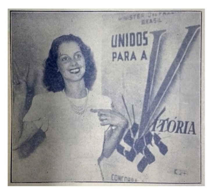
Figure 3: The support of mineira woman to the National Aviation Campaign

Similar arguments were published in another article (Pinto, 1943, p. 66) about the National Aviation Campaign, in which the mineira woman supported the country as an "air nurse" or "passive anti-air defense". The use of the distinctive of the Belly Fraternity or the Brazilian Air Force reinforced patriotic values and the role of women in caring for each other.