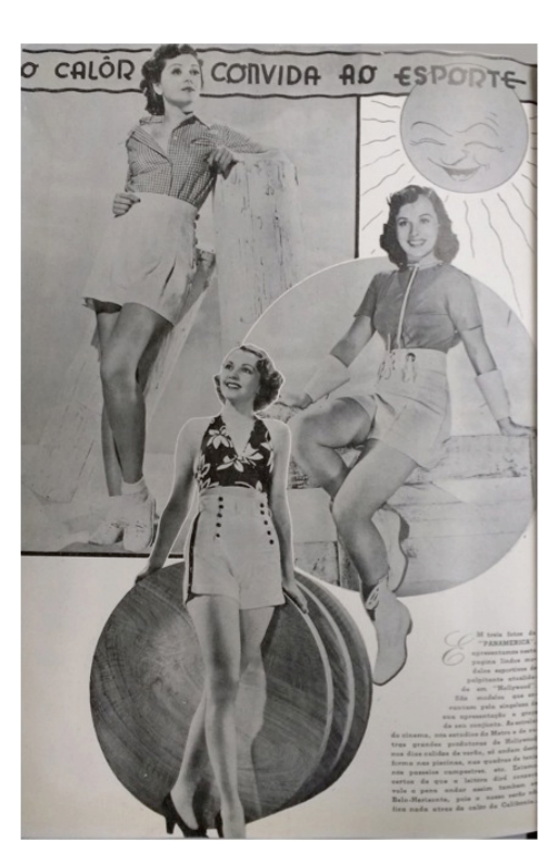
Figure 5: The heat invites to sports

The image of the beauty and elegance of the women was reproduced by fashion, through the introduction of seasonal novelties, which indicated its use in the set of senses that guided the mentality of the time. The "beautiful" sports models were used by the stars "on hot summer days, (...) in the swimming pools, tennis courts and country walks" (O calor convida as piscinas, 1939, p. 68). Unlike the other images previously presented, the fashion section of the magazine generally featured a composition with several photographs showing the full-body stars in order to display the models of dress. Figure 5 presents three different models, in scenes that try to reproduce the stars in the open air, but the use of scenographic features is perceptible. The young women did not wear specific suits for the mentioned sports, and their poses did not refer to sports practice, indicating that the interest of the article was to propagate the image of beautiful and healthy bodies, conquered through the practice of physical exercises. A new body appearance, a new way of dressing, a new life style. It is even noticed that one of the stars was wearing "high heels", an element of fashion fetish, a sign of seduction and elegance. The illustration of the sun smiling and radiating its heat over the bodies, signaling health and vitality, invited to sports in the summer.