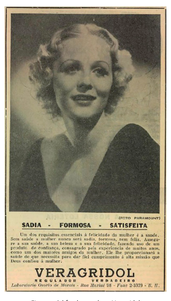
Figure 1: Ad for the regulator Veragridol