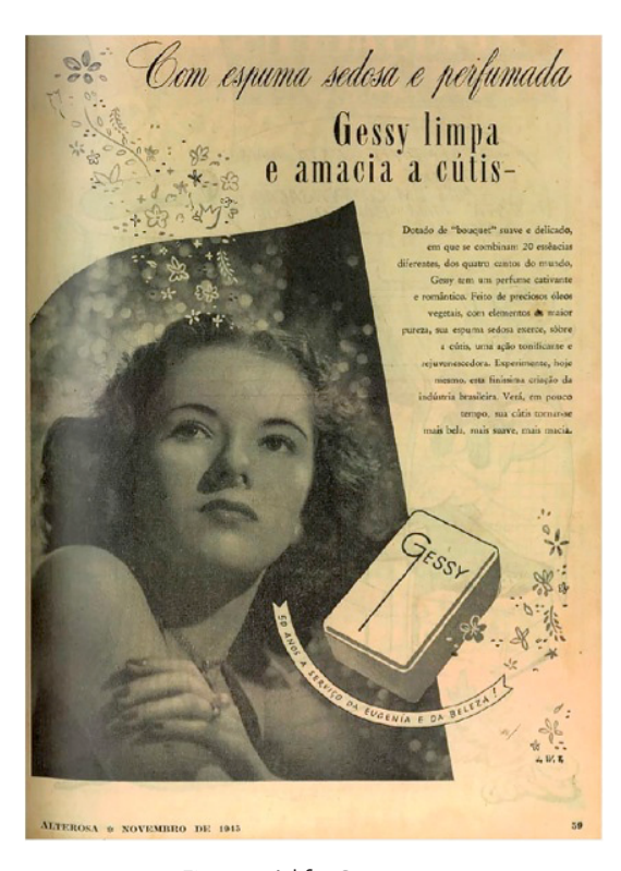
Figure 2: Ad for Gessy soap

The use of the Lever soap guarantees the "perfect whiteness" of the skin. The "beautiful" Dorothy Lamour (Paramount) always used the product. "The moment the delicious foam of Lever caresses your skin, you will come into possession of the beauty secret of the stars!" (Sabonete Lever, 1945b, p. 119). The foam that caressed the skin was the vehicle that transmitted the beauty (cleaning) of the movie stars to the other women. The positive value given to the whiteness associated cleaning to white, which conveyed the idea of purification. In Gessy's slogan, these values were evident: "50 years at the service of Eugenia and beauty!" (Sabonete Gessy, 1945, p. 59). The text of the ad highlighted, in the constitution of the product, "pure" elements and the "tonifying" and "rejuvenating" property of the skin. The message indicated that the hygienic precepts aimed at women had a greater meaning. In addition to cleanliness being essential for the gestation of healthy offspring, cleanliness was associated with a concept of whitening (and supposed strengthening) of the breed, being synonymous with purity and beauty.