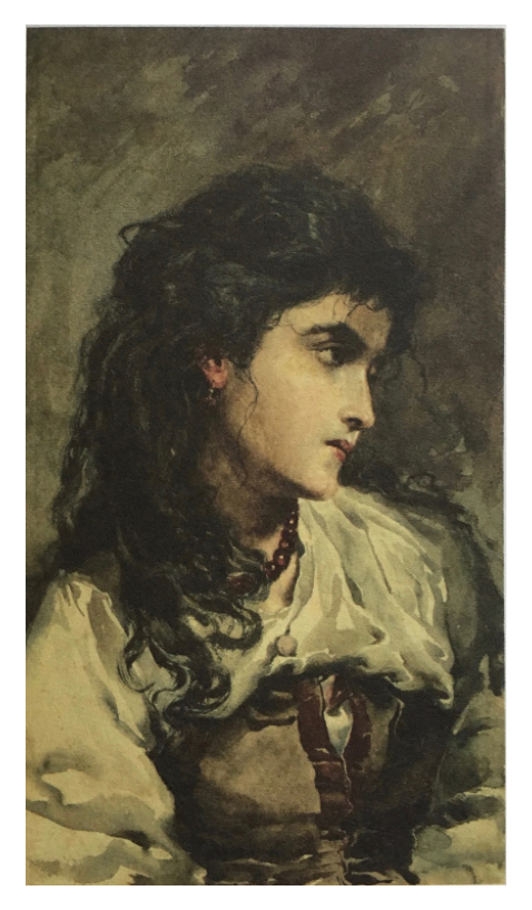
Figure 3: Gips y, Maria Pia, undated. Watercolour on paper, 45,6x25,3 cm. Inv. PNA 4656