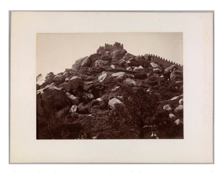
Figure 5: Sintra, The Moorish Castle, Maria Pia, 1893. Gelatin and Silver Print on paper, mounted on a cardboard. Image: 15 x 20,6 cm; Cardboard: 21,3 x28,4 cm. Inv. PNA 62600

The adoption of the bicycle is one more element that reveals her modern attitude, that is, the taste for technical innovations, that she quickly adopts (Figure 6). Which also reflects her cosmopolitanism (Pallier, 2006; Peacock & Cerqueira, 2007; Lopes, 2011).