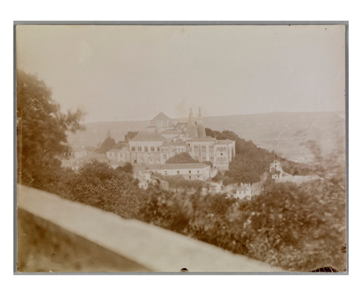
Figure 1: Sintra, Palácio da Vila, Maria Pia, 1892. Gelatin and Silver Print on paper, 20,9x15,7 cm. Inv. PNA 62334

Maria Pia is one of the few authors mentioned in the History of the Photographic Image in Portugal (op. cit.), and this happens due to her participation in the I National Exhibition of Amateur Photographers , in 1899, already referred to. On this date it is likely that she already devoted herself to photography at least for a decade. According to Maria do Rosário Jardim, the first signed prints that are now in the collection of the Ajuda Palace, date from 1892 (Jardim, 2016, p. 170) (Figure 1). In addition, the notebooks of the servants of Queen Maria Pia document her regular photographic activity soon after 1889, the year of the death of D. Luís. Her status changes at this time and so does her availability, that increases.