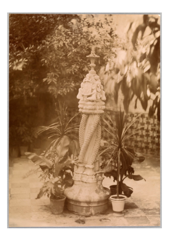
Figure 8: Sintra, Palácio da Vila, Column Torsa in the Courtyard of the Nozzle (or Central plaza). Maria Pia, 1892. Gelatin and Silver Print on paper, 18,1x12,9 cm. Inv. PNA. 61764

The photographs of Maria Pia which are accessible to the public, do not follow under the category of family and domestic photography, even if there are a few documenting the leisure activities of the group surrounding the queen. Maria Pia clearly privileged the landscape genre, representing both the fields and the seafronts. The representation of the sea was a famous genre known as "marines", which was very appreciated in the painting of the time. The attention she gave to the monuments, to room interiors, and decorative details characteristic of the architecture, reveal her well educated look and taste (Figure 8). This taste is also evident with regard to the documentation of the people of the region. These representations were very much in tune with the taste of the painters of the time. These search for human "types", turning peoples into the "others," and into the "regional types", emerge in accordance to the works of ethnography and anthropology, as well as the historiography of the time. These sciences were concerned with characterizing the natural landscapes and the cultural regions and countries, contributing to the affirmation of a nationalism trend that was, of course, dear to the monarchy.