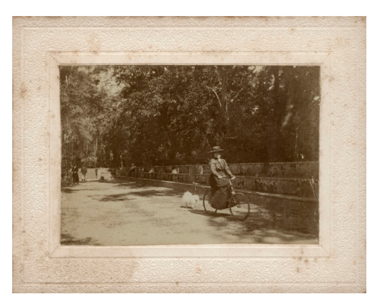
Figure 6: Maria Pia riding her bike in the Palace of Queluz. Unknown Author. Gelatin and Silver Print on paper, mounted on a cardboard. Image: 15 x 20,6 cm; Cardboard: 21,3 x28,4 cm. Inv. PNA 62600

precisely with a type of bike, virtually identical to the contemporary models, the so-called "safety bicycle", since it eliminated the disadvantages of the models of high wheels that easily fell.