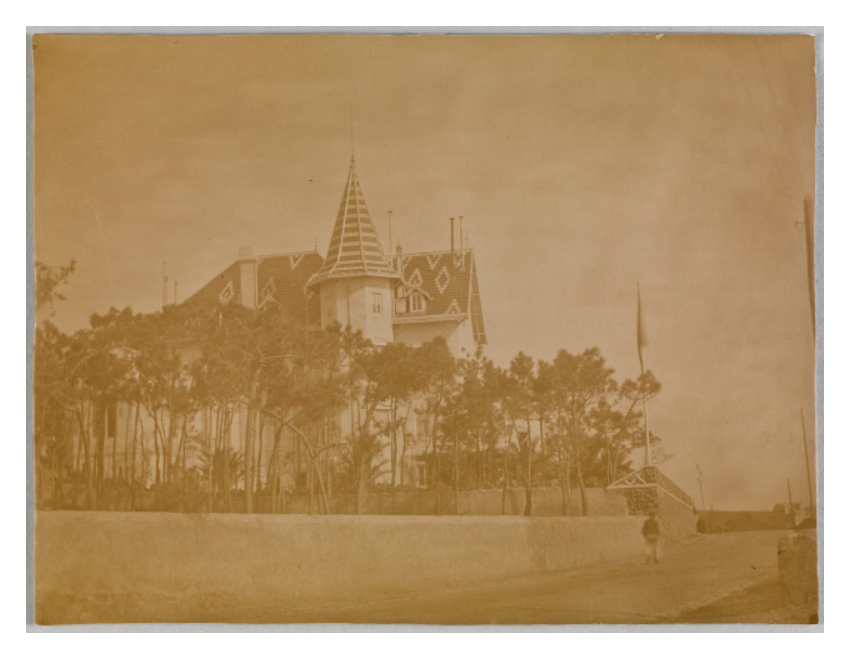
Figure 4: The Royal Palace of Estoril, Maria Pia, 1894. Gelatin and Silver Print on paper, 15,8x21 cm. Inv. PNA. 62263