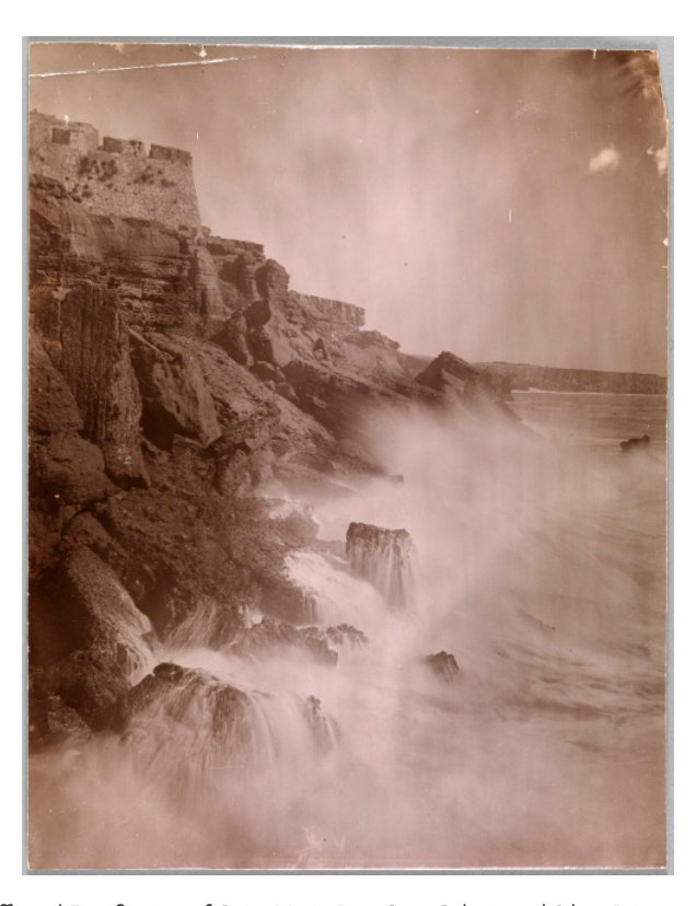
Figure 9: Cascais, Cliffs and Fortification of Guia, Maria Pia, 1894. Gelatin and Silver Print on paper, 20,7 x 15,7 cm. Inv. PNA. 62195

In contrast, the critic of the journal Novidades is very enthusiastic: "Her Majesty the queen Lady Maria Pia has superb photographies, representing the launching of a bridge in Tancos, several stretches of the palace of Cintra, and the beach of Cascais" (A Exposição Nacional de Photographias, 1899, s.p.). And broadly speaking about the work of the royal family, this critic states that they present "magnificent photographies by the sharpness, the distribution of light and by the choice of subject". The newspaper O Século argues that photography is an art, and includes Maria Pia in the group of artists: "Who will deny that such a wave of the queen's lady D. Maria Pia (...) are not products of the spirit and exquisite taste, of a temperament of an artist?" (Exposição nacional de photographia, 1900, p. 1).